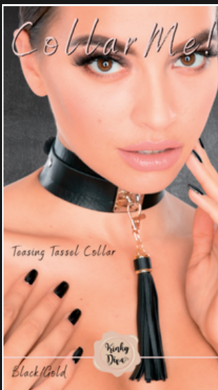
Box: 17cm x 10cm x 5cm

Remove the tassel to tease or please your partner. The soft vegan leather tassels caresses the skin. Great item for foreplay