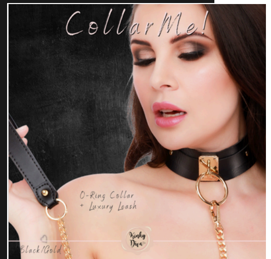
Box: 17cm x 17cm x 5cm