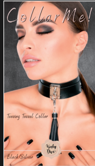
Box: 17cm x 10cm x 5cm

This collar comes with a small tassel that you can remove. Great for a naughty tap or to tease the skin with its soft vegan leather tassels