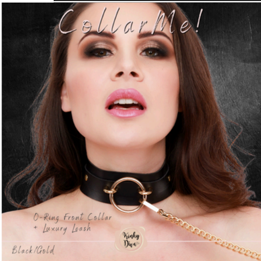
Box: 17cm x 17cm x 5cm